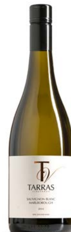
Tarras Vineyards Sauvignon Blanc

Region: Central Otago Pack Size: 6 x 750ml