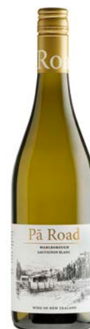
Pā Road Sauvignon Blanc

Region: Marlborough Pack Size: 6 x 750ml