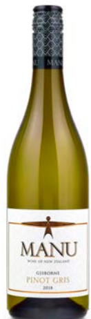
Manu Pinot Gris Region: Gisborne Pack Size: 12 x 750ml