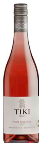
Tiki Estate Rosé

Region: Marlborough Pack Size: 6 x 750ml