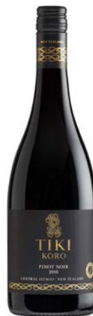
Tiki Koro Pinot Noir

Region: Hawke's Bay Pack Size: 6 x 750ml