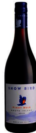
Snow Bird Pinot Noir

Region: Various South Island Pack Size: 6 x 750ml