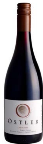
Ostler Caroline's Pinot Noir

Region: North Otago Pack Size: 6 x 750ml