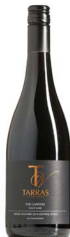
The Canyon Pinot Noir

Region: Central Otago Pack Size: 6 x 750ml