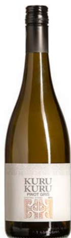
KURU KURU Pinot Gris

Region: Marlborough Pack Size: 12 x 750ml