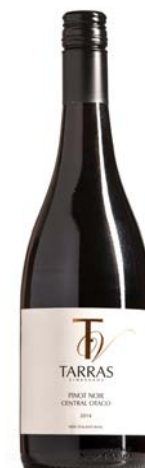
Tarras Vineyards Pinot Noir

Region: Marlborough Pack Size: 6 x 750ml