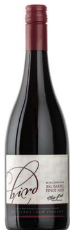
Steve Bird Wines Big Barrel Pinot Noir Region: Marlborough Pack Size: 12 x 750ml