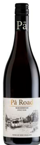
Pā Road Pinot Noir

Region: Marlborough Pack Size: 6 x 750ml