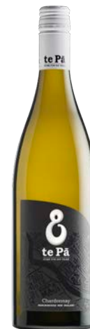
te Pā Chardonnay

Region: Marlborough Pack Size: 6 x 750ml