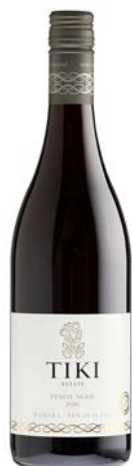
Tiki Estate Pinot Noir

Region: Marlborough Pack Size: 6 x 750ml