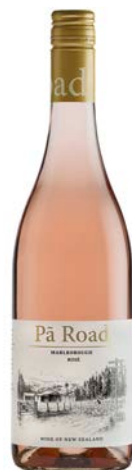
Pā Road Rosé

Region: Marlborough Pack Size: 6 x 750ml