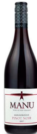
Manu Pinot Noir Region: Marlborough Pack Size: 12 x 750ml