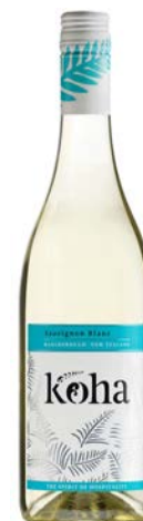
Koha Sauvignon Blanc

Region: Marlborough Pack Size: 6 x 750ml