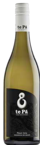
te Pā Pinot Gris

Region: Marlborough Pack Size: 6 x 375ml