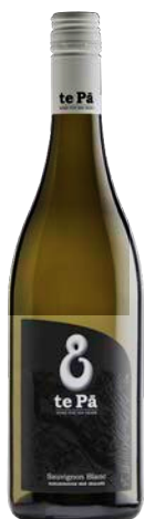
te Pā Sauvignon Blanc

Region: Marlborough Pack Size: 6 x 750ml