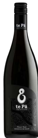
te Pā Pinot Noir

Region: Marlborough Pack Size: 6 x 750ml