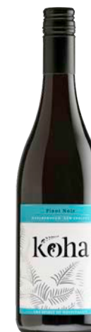
Koha Pinot Noir

Region: Marlborough Pack Size: 6 x 750ml