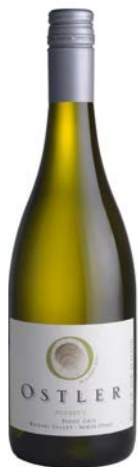
Ostler Audrey's Pinot Gris

Region: North Otago Pack Size: 6 x 750ml