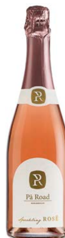
Pā Road Sparkling Rosé

Region: Marlborough Pack Size: 6 x 750ml