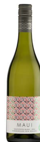
Maui Sauvignon Blanc

Region: Marlborough Pack Size: 12 x 750ml