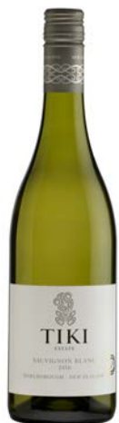
Tiki Estate Sauvignon Blanc

Region: Marlborough Pack Size: 6 x 750ml