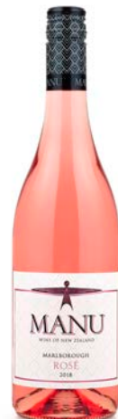
Manu Rosé Region: Marlborough Pack Size: 12 x 750ml