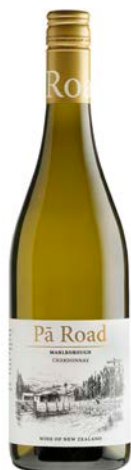
Pā Road Chardonnay

Region: Marlborough Pack Size: 6 x 750ml