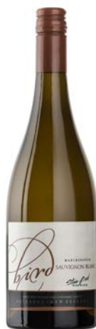
Steve Bird Wines Sauvignon Blanc Region: Marlborough Pack Size: 12 x 750ml