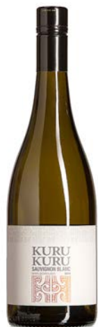
KURU KURU Sauvignon Blanc

Region: Central Otago Pack Size: 12 x 750ml