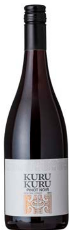
KURU KURU Pinot Noir

Region: Central Otago Pack Size: 12 x 750ml