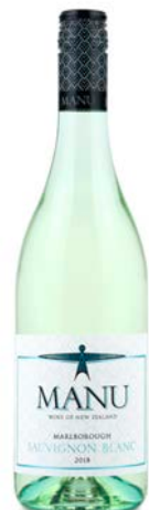
Manu Sauvignon Blanc Region: Marlborough Pack Size: 12 x 750ml